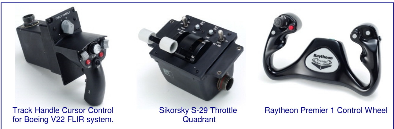
Track Handle Cursor Control for Boeing V22 FLIR system.

Various switches used in Control Grips, Wheels, Throttles, Cyclic, Collectives, Controls, Flight Control systems and Control Devices. Used in Fixed Wing Aircraft, Rotary aircraft, Land Vehicles and Weapons Systems.